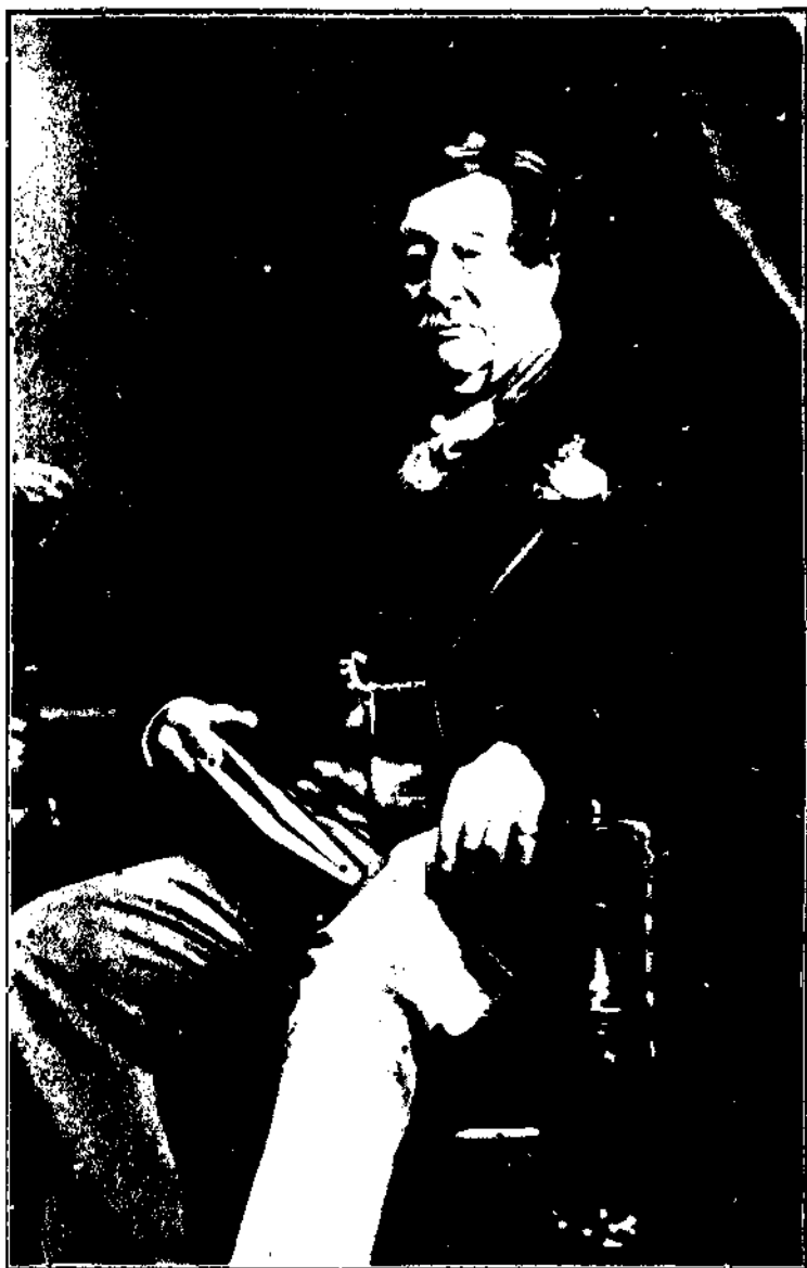
FIELD MARSHAL VISCOUNT COMBERMERE, K.C.B., K.S.I. A PORTRAIT TAKEN SHORTLY BEFORE HIS DEATH IN 1865.