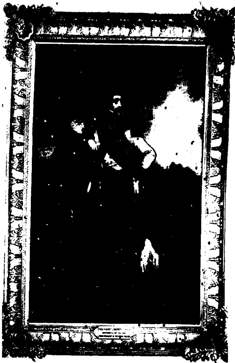
FIELD MARSHAL VISCOUNT COMBERMERE, K.C.B., K.S.I. FIRST PATRON OF THE BENGAL CLUB, 1827.